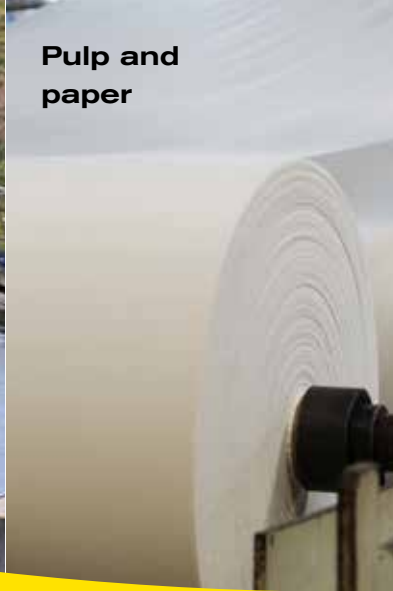
Pulp and paper