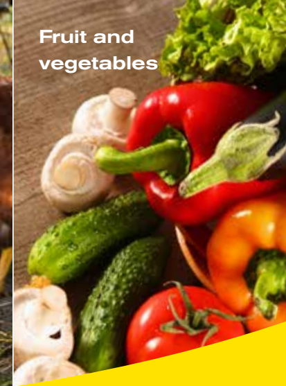
Fruit and vegetables