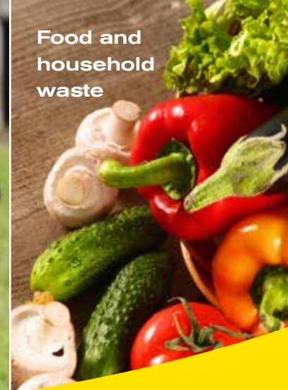
Food and household waste