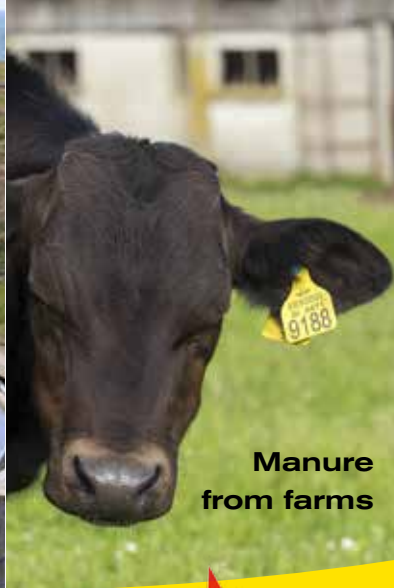
Manure from farms